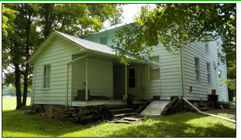
5 BR, 2 Bath Farmhouse Baseboard Hot Water Oil Heat Private Well, On Site Septic